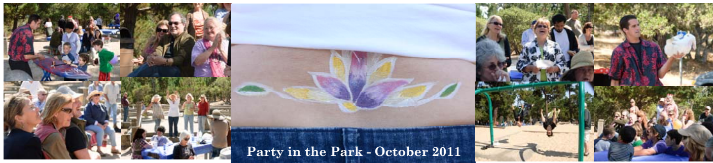
Party in the Park - October 2011